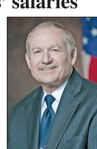
Union County Sheriff Mack

not that unusual. What is different is the fact that 65 of those officers died as a result of gunfire, which represents a 69